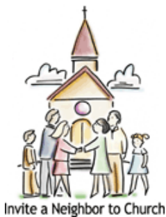
Invite a Neighbor to Church

Sunday, December 1 Budget & Elections 11:15 am Monday, December 2 Board of Elders 7:30 pm Tuesday, December 3 Board of Trustees 6:30 pm Wednesday, December 4 7 th Grade Confirmation 5:30 pm Thursday, December 5 Advent Supper 5:15 pm Advent Worship 6:30 pm Saturday, December 7 Sunday School Program Practice 9:00 am to 10:30 am Sunday, December 8 9 th Grade Confirmation 5:30 pm Wednesday, December 11 8 th Grade Confirmation 5:30 am Thursday, December 12 LWML Meeting 10:00 am with party to follow Advent Worship 6:30 pm Saturday, December 14 Sunday School Program Practice 9:00 am to 10:30 am Wednesday, December 18 7 th Grade Confirmation 5:30 am Saturday, December 21 Sunday School Program Practice 9:00 am to 11:00 am Hot Dog party to Follow Sunday, December 22 Sunday School Christmas Program Tuesday, December 24 Sunday School Christmas Eve Worship 6:30 pm Wednesday, December 25 Christmas Day Worship 9:00 am Sunday, December 29 Worship w/HC 9:00 am